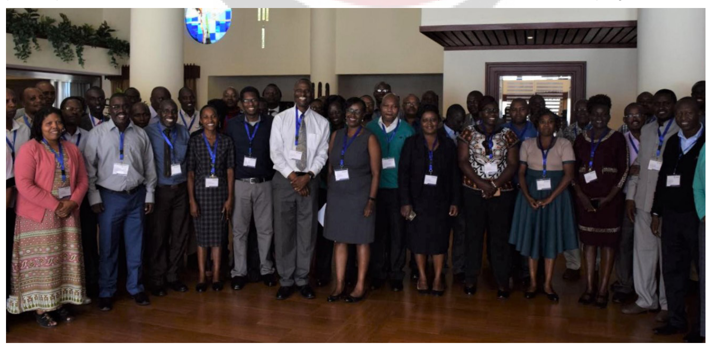
Participants at the ICT Faculty Forum

The KENET Special Interest Group on Computer Science and Information Systems (SIG CSIS) successfully organized the first