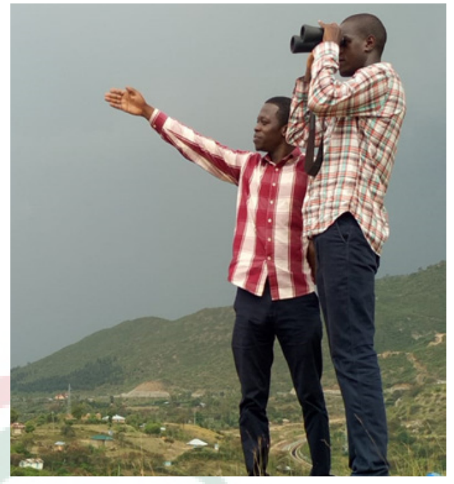
KENET engineers evaluating extreme engineering challenges to Deliver Connectivity to KMFRI Sang'oro

KENET is also in the process of connecting Tunapanda Institute, a