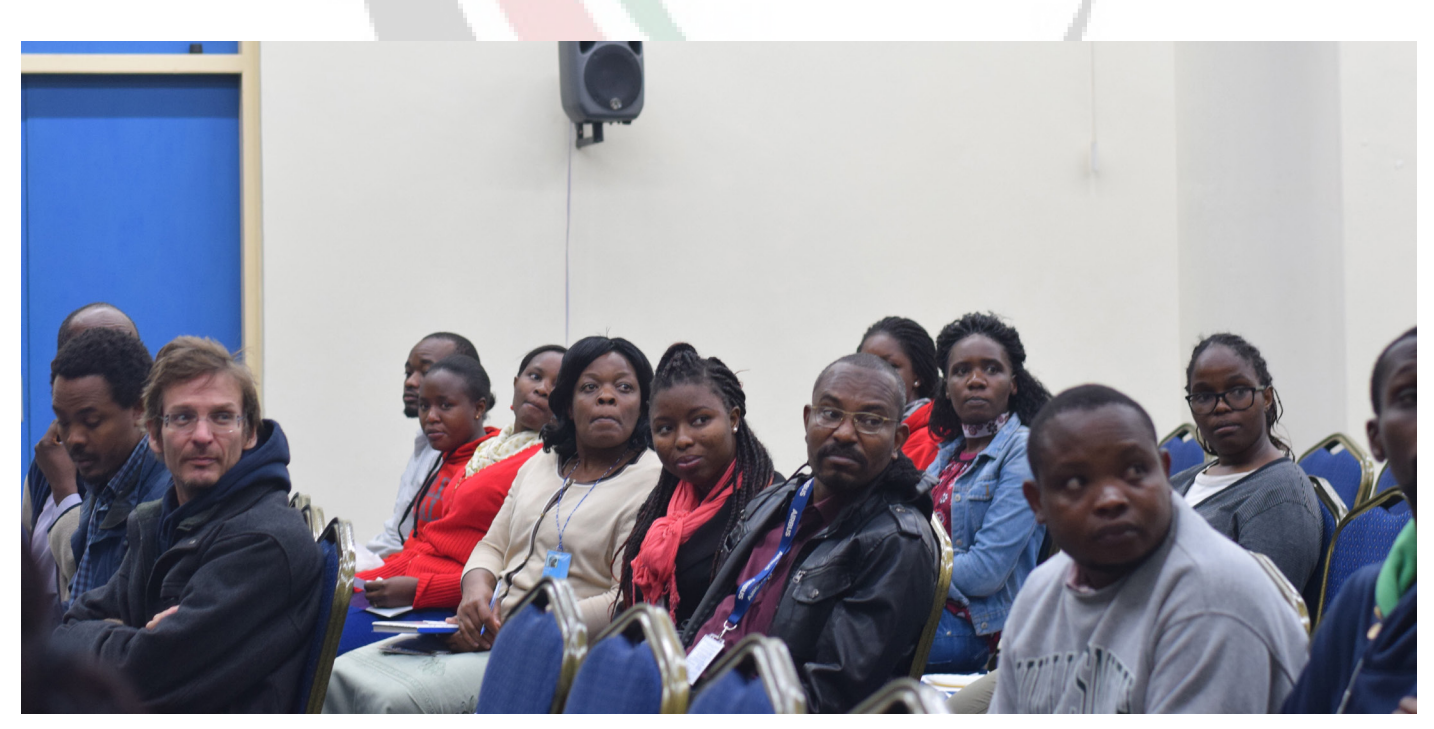
Participants at the ICIPE Forum

Four abstracts were selected for the <u>KENET Computer Science (CS)</u> and Information Systems (IS) Mini-Grant, an initiative intended to promote early stage CS/IS research and development in current and emerging research areas in Distributed Ledger Technologies (DLTs) and Big Data Analytics (BDA). The grant attracted 35 submissions from 16 public and private Universities when the call was announced on March 26, 2018. The grant amounted to Kshs. 1, 500, 000 (15,000