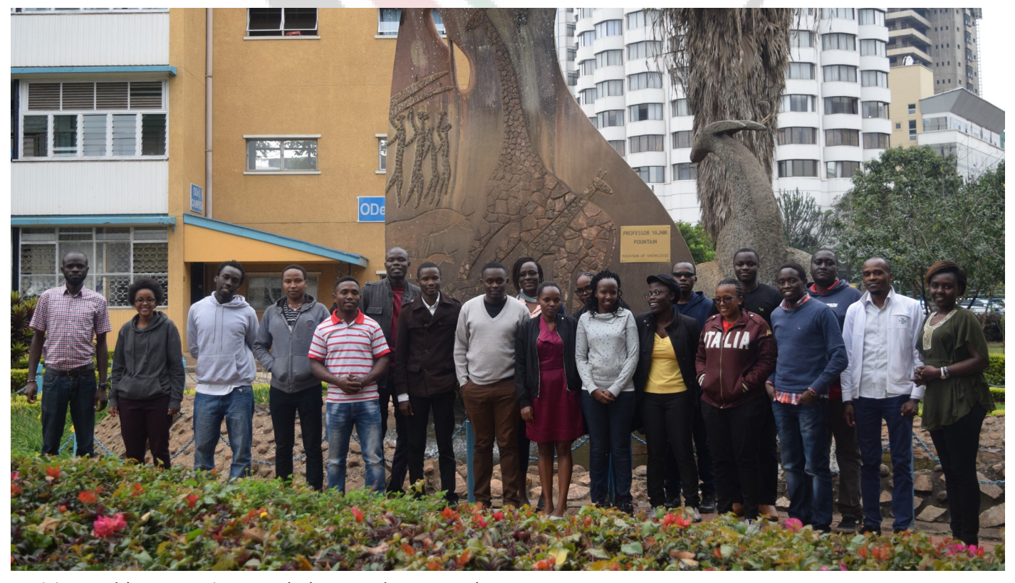
Participants of the Open Science Hackathon pose for a group photo