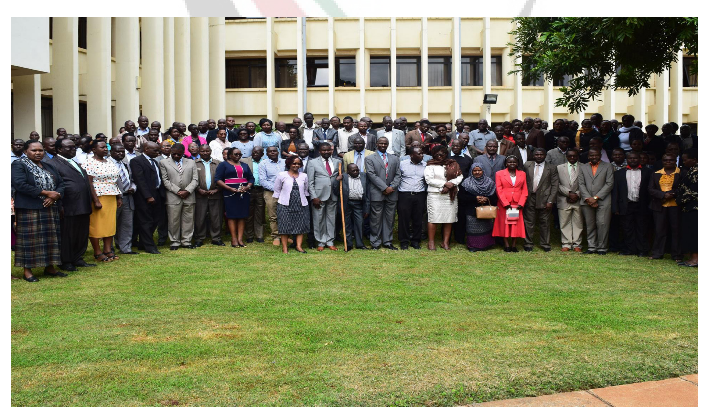
Participants during the half-day KALRO Forum

Consequently, other research Forums were held at Maseno University, Egerton University, Regional Centre for Mapping Resource for Development (RCMRD), and The IGAD Climate Prediction and Applications Centre (ICPAC) in October 2018. In addition to providing basic high-speed Internet as a facilitator for research,